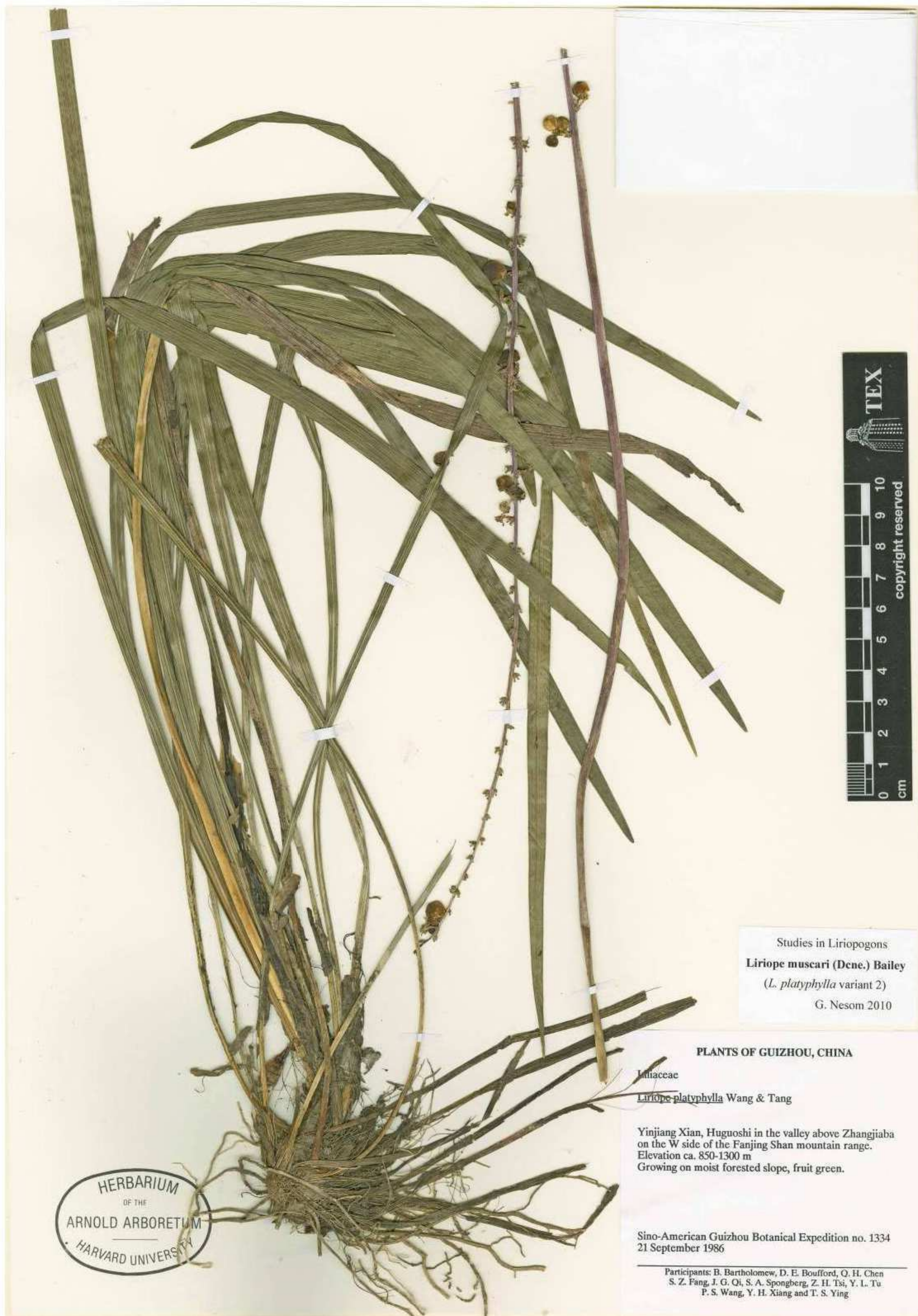
Figure 7. Liriope muscari sensu lato, variant of “ platyphylla ” expression (see comments in text).